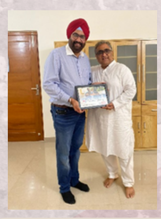
Kunal Ganjawala launching his music album