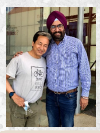
with Sonam Wangchuk